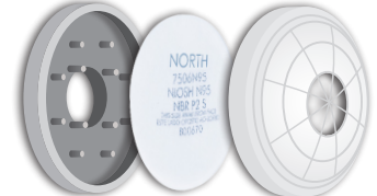
* adapter filter * retainer G2537 G2523/25 G2537

Gerson pillow shape filters cannot be used without a cartridge.