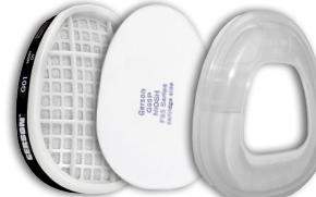
cartridge filter retainer G1901/03 G1920 G1929