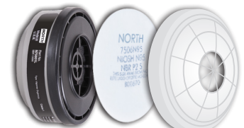
cartridge filter retainer G22501/03 G2523/25 G2536

3M pillow shape filters & North round white filters can be used without a cartridge. But you need an adapter that attaches to mask. And you also need a retainer to hold filter onto the adapter.