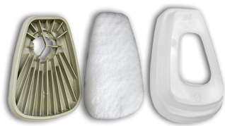
adapter filter retainer G2237 G2230/32 G2238

3M pillow shape filters & North round white filters can be used without a cartridge. But you need an adapter that attaches to mask. And you also need a retainer to hold filter onto the adapter.