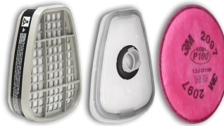
cartridge adapter filter G2201/03 G2239 G2240/44/46

3M & North's round pink filters can be used on top of cartridge. But you need an adapter that attaches to the cartridge. The filter attaches to the adapters.