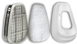
cartridge filter retainer G2201/03 G2230/32 G2238

White filters are used on top of cartridges. But you need a retainer that holds filter onto the cartridge.