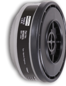
G2501 or G2503

These round filters attach directly onto a respirator. No adapters are needed. These pink filters can also be used with a cartridge as shown below.