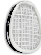
G1901 or G1903